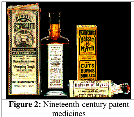
Figure 2: Nineteenth-century patent medicines

all sorts. Many nineteenth-century medicines were designed to “cleanse” the body or masked illnesses using ingredients such as alcohol and narcotics.